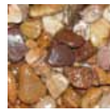
Trent Pea Gravel