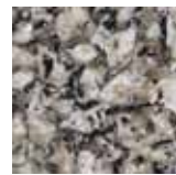
Silver Grey Granite